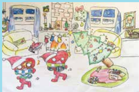
Chen Yu Xuan, 11 years old