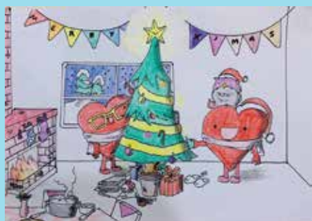
Wong Zi Ting, 12 years old